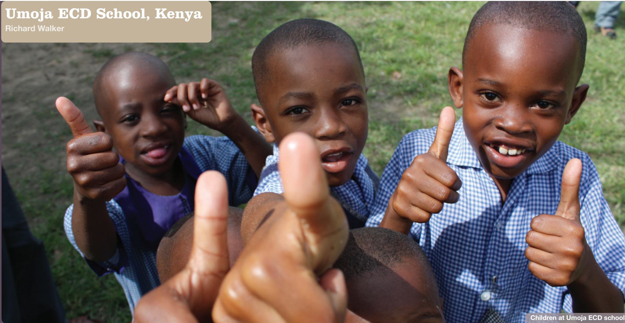
Children at Umoja ECD school