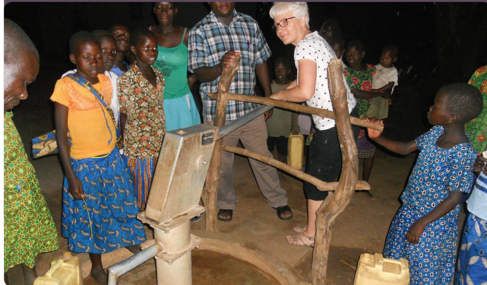
Awire borehole, Uganda