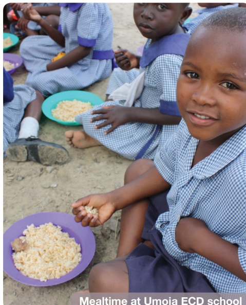
Mealtime at Umoja ECD school

The parents were very happy to learn that, thanks to your generous donations, the school has funding for 2016. The smiles on the children's faces remind you that Meal-a-Day helps those in greatest need with a good start in life.